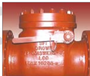
lock open lever