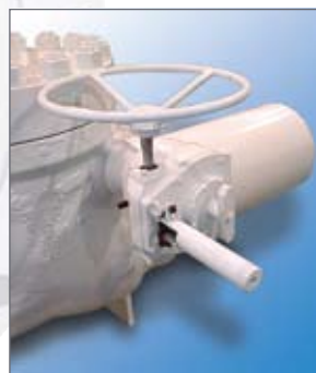
worm gear operator